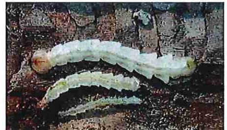
Figure 3. Second, third, and fourth stage larvae.