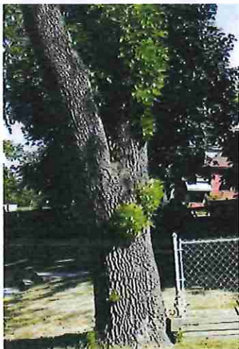
Figure 8. Epicormic branching on a heavily infested ash tree.

late April or May. Newly eclosed adults often remain in the pupal chamber or bark for 1 to 2 weeks before emerging head-first through a D-shaped exit hole that is 3 to 4 mm in diameter (Fig. 5).