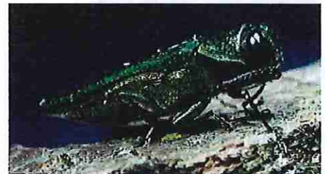
Figure 1. Adult emerald ash borer.

Prepupal larvae overwinter in shallow chambers, roughly 1 cm deep, excavated in the outer sapwood or in the bark on thick-barked trees. Pupation begins in