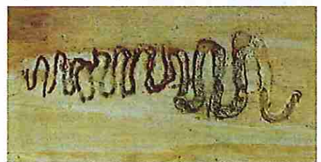
Figure 4. Gallery of an emerald ash borer larva.