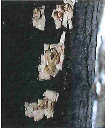
Figure 6. Jagged holes left by woodpeckers feeding on larvae.