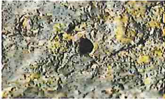
Figure 5. D-shaped hole where an adult beetle emerged.