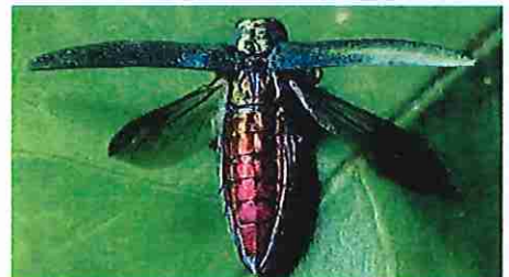
Figure 2. Purplish red abdomen on adult beetle.